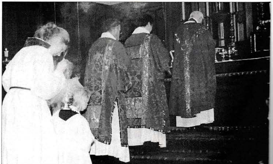
Lenten Solemn Mass

Web Sites of Interest Check out the Project Canterbury website: http://justus.anglican.org/resources/pc/ . This site contains a huge collection of Anglican literature. Also, a most comprehensive site on the Book of Common Prayer can be found at: http://justus.anglican.org/resources/bcp/ . What I find especially fascinating is looking through the very first version of the BCP from 1549.