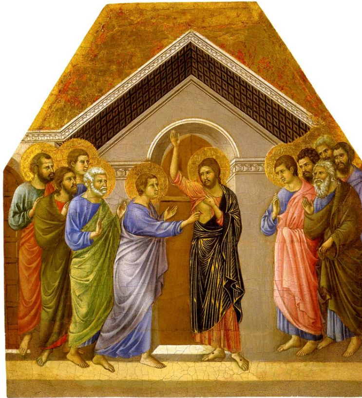
The Incredulity of Thomas Duccio di Buoninsegna, 1311; Museo dell'Opera del Duomo, Siena, Italy