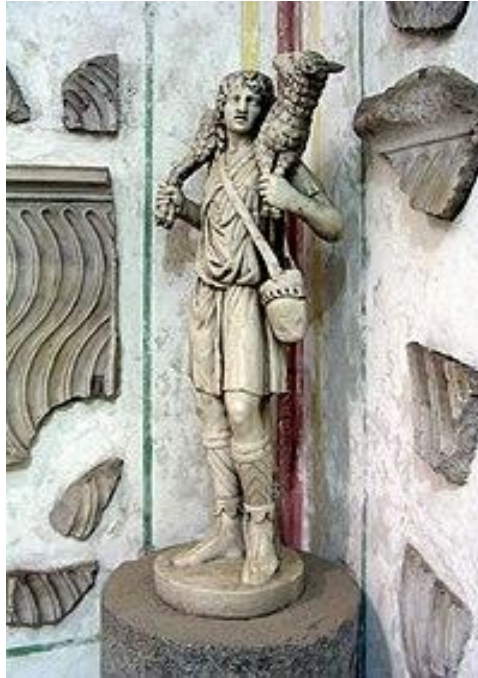
The Good Shepherd, c. 300-350 AD Catacombs of Domitilla, Rome