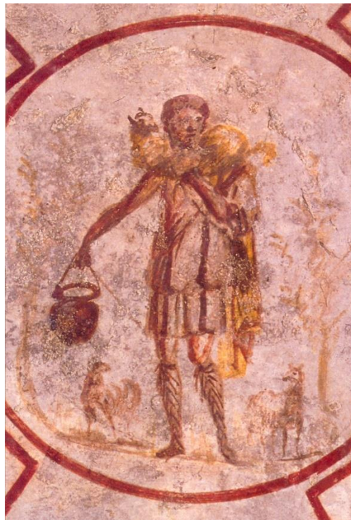
The Good Shepherd, 3rd c, Catacomb of Callixtus, Rome