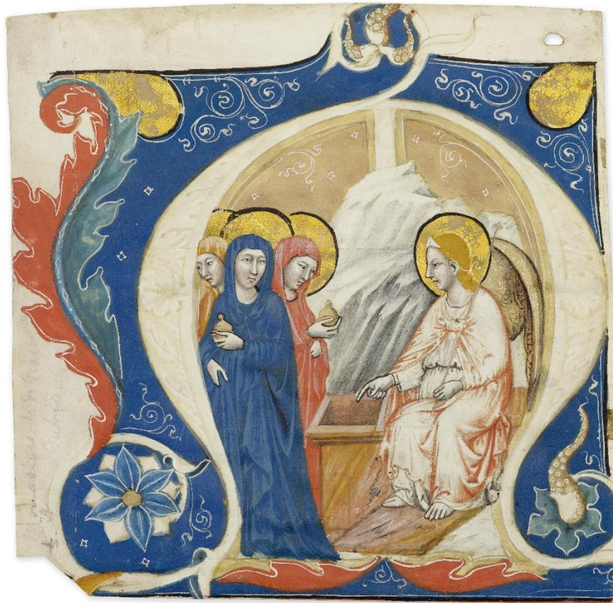
The Three Marys, from an Italian Miniature, c. 1320