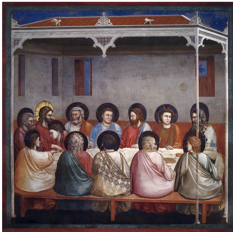
The Last Supper - Giotto di Bondone - 1305