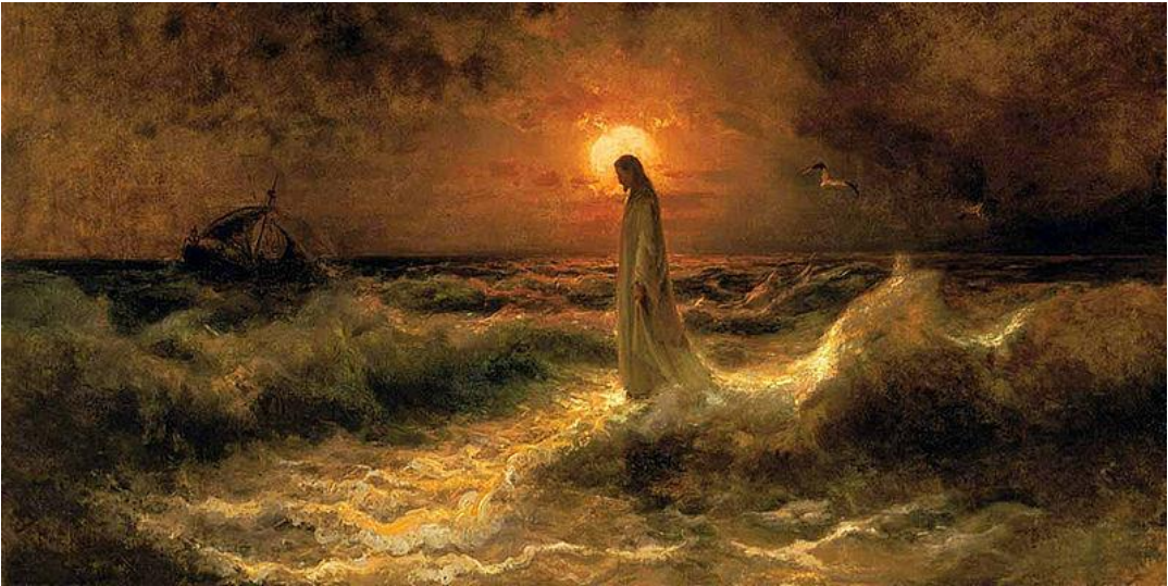
Christ walking on water, Julius Sergius von Klever, 1880 This painting is in a private collection

Saint Thomas's Anglican Church 383 Huron Street, Toronto, Ontario M5S 2G5 416-979-2323 www.stthomas.on.ca office@stthomas.on.ca