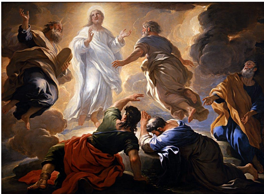
The Transfiguration of Christ , Luca Giordano, 1685 La Galleria degli Uffizi, Firenze

Saint Thomas's Anglican Church 383 Huron Street, Toronto, Ontario M5S 2G5 416-979-2323 www.stthomas.on.ca office@stthomas.on.ca