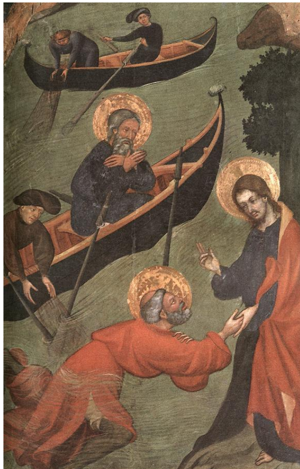
Jesus supports St Peter on the water Lluís Borrassa, 15c