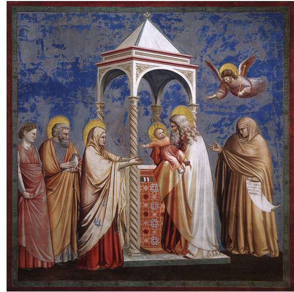
The Presentation of Christ in the Temple, Giotto, 1305