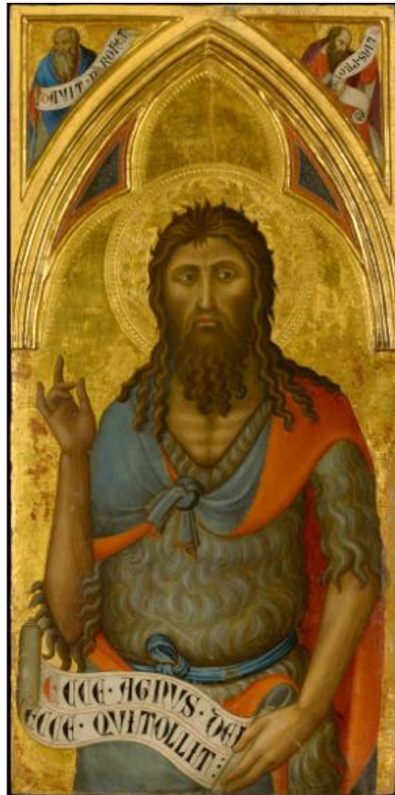
Saint John the Baptist , Luca di Tommè, c. 1380 J. Paul Getty Museum, Los Angeles

Saint Thomas's Anglican Church 383 Huron Street, Toronto, Ontario M5S 2G5 416-979-2323 www.stthomas.on.ca office@stthomas.on.ca