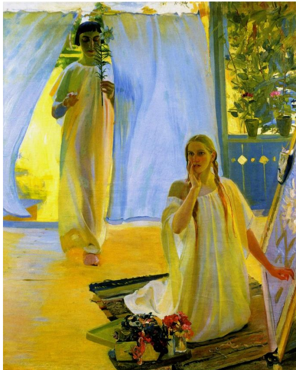
The Annunciation, Alexander Murashko, 1909 The National Art Museum of Ukraine, Kiev