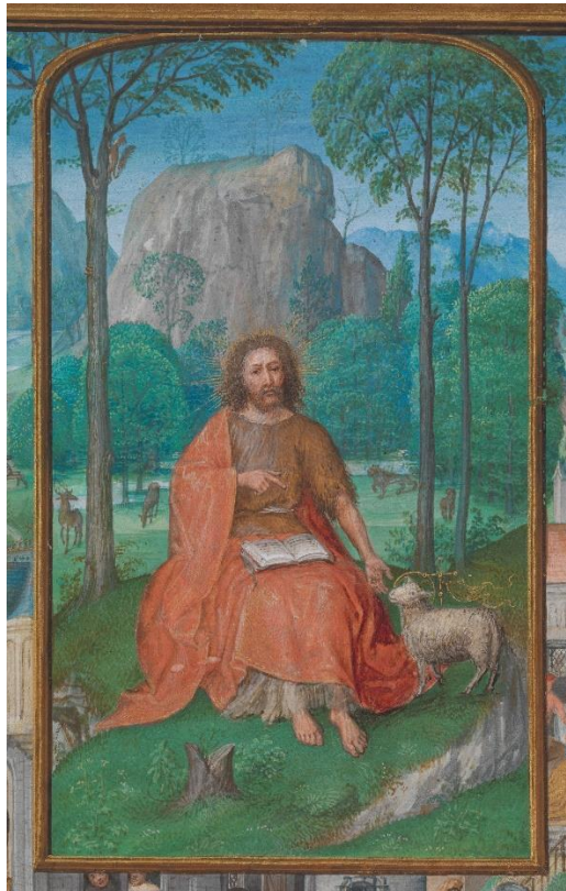
Detail of Manuscript Illumination with Scenes from the Life of Saint John the Baptist ca. 1515 Master of James IV of Scotland (probably Gerard Horenbout) Metropolitan Museum of Art, New York