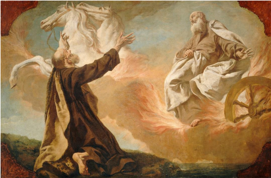
Elijah taken up in a Chariot of Fire, Giuseppe Angeli, c. 1740 The National Gallery, London