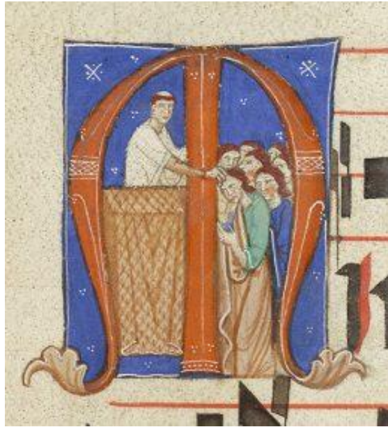
New York: Morgan Library, M. 933, fol. 57r of a Gradual; initial M beginning Introit of Mass for Ash Wednesday (Perugia?, c. 1260-1270).