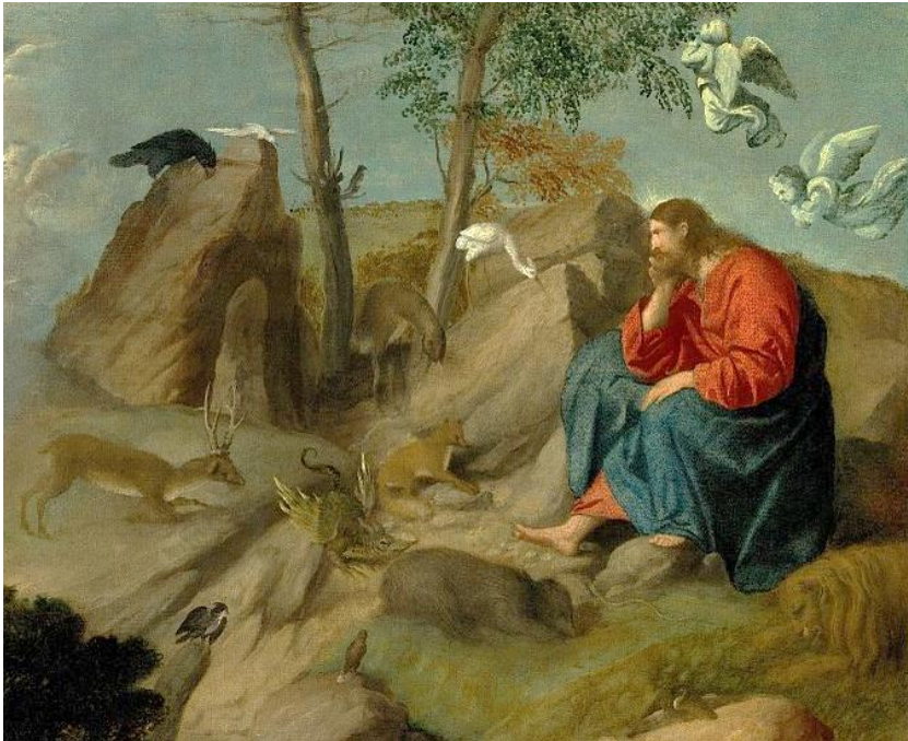
Christ in the wilderness, Alessandro Bonvicino, c. 1515-20 The Metropolitan Museum of Art, New York City