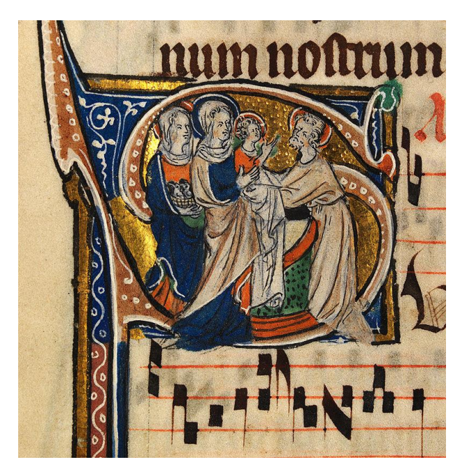
The Presentation of Christ in the Temple from the Sherbrooke Missal, c. 1315

The Presentation of our Lord Jesus Christ in the Temple Commonly called Candlemas