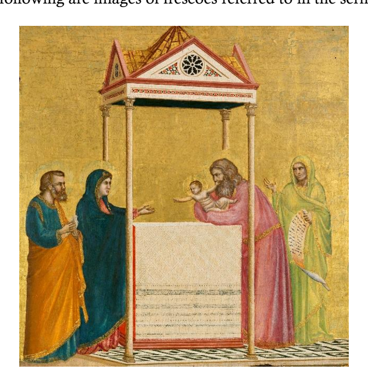
HOMILY The following are images of frescoes referred to in the sermon.

Giotto di Bondone (c. 1266-1337), The Presentation of the Infant Jesus in the Temple (La presentazione di Gesù Bambino al Tempio), c. 1320. Tempera on panel, in the collection of the Isabella Stewart Gardner Museum (Fenway Court), Boston, MA. Published under Creative Commons license CC BY-NC-ND 4.0 and the terms and conditions found at www.gardnermuseum.org .