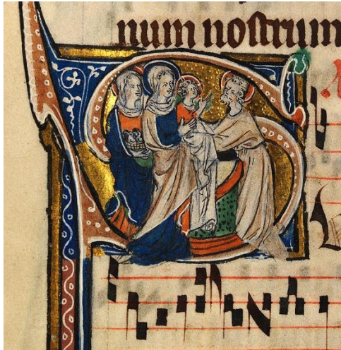
The Presentation of Christ in the Temple from the Sherbrooke Missal, c. 1315

The Presentation of our Lord Jesus Christ in the Temple Commonly called Candlemas