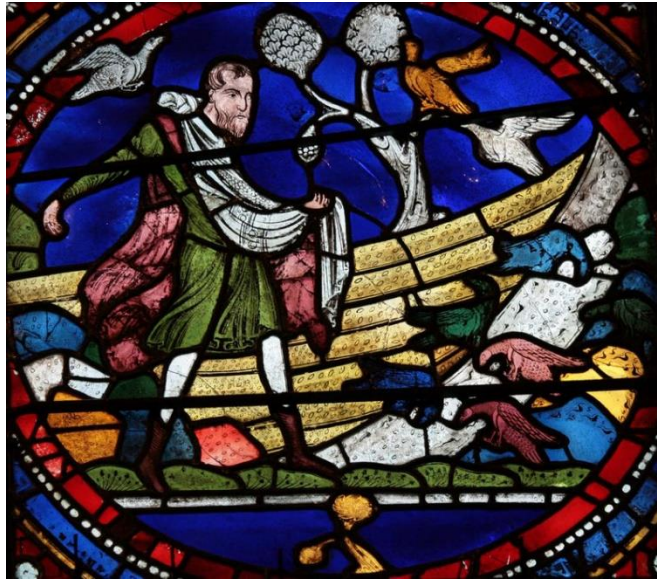
Medieval stained glass at Canterbury Cathedral dating from c. 1180, depicting the first scene of the Parable of the Sower, in which seeds scattered on stony ground are eaten by birds.

Sung Eucharist at 11 o'clock livestreamed