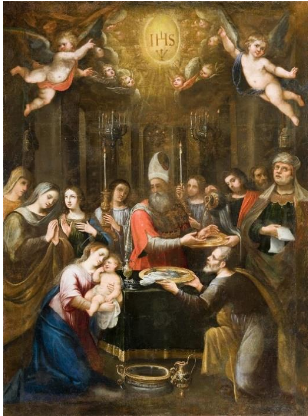
The Naming and Circumcision of Jesus , by an unknown artist, c. 1633 Museu de São Roque, Santa Casa da Misericórdia de Lisboa