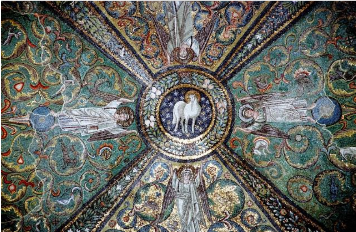
6 th century mosaic depicting the Lamb of God Basilica of San Vitale, Ravenna, Italy

Saint Thomas's Anglican Church 383 Huron Street, Toronto, Ontario M5S 2G5 416-979-2323 www.stthomas.on.ca office@stthomas.on.ca