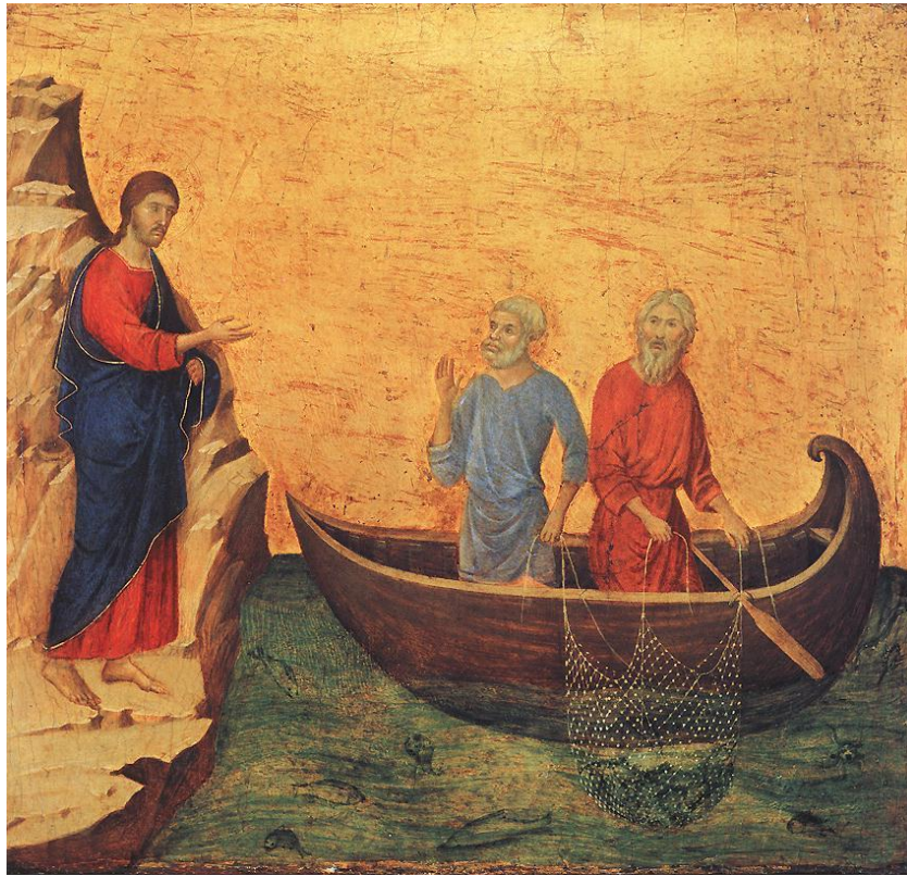
The Calling of the Apostles Peter and Andrew Duccio di Buoninsegna, 1308-1311