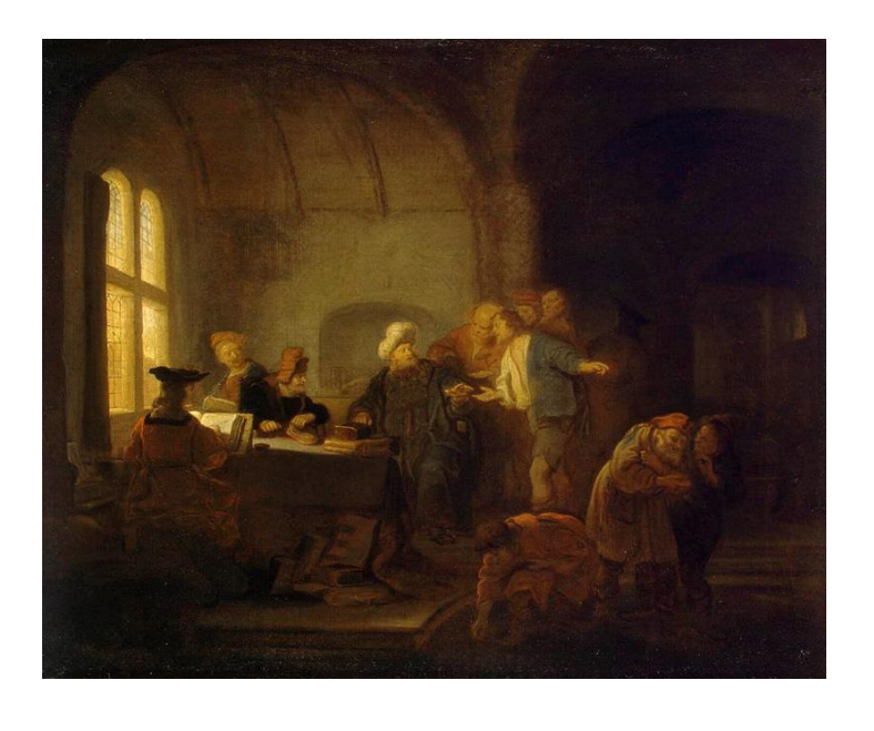
Parable of the Workers in the Vineyard Salomon Konick, 1647