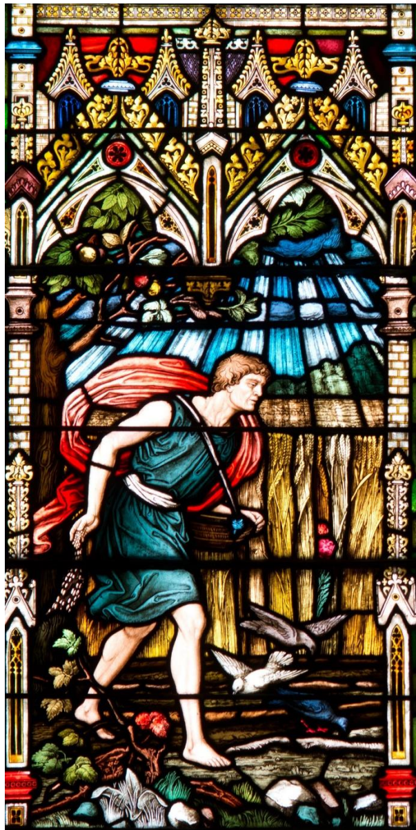
The Parable of the Sower (Stained Glass Detail) from the Parable Window at St James Cathedral, Toronto.