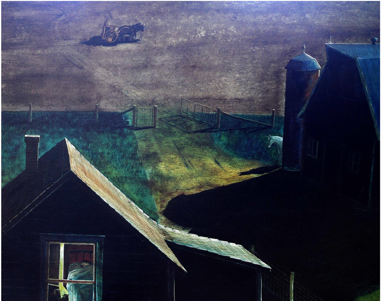
Satan Sowing Weeds in the Church William Kurelek, 1963.