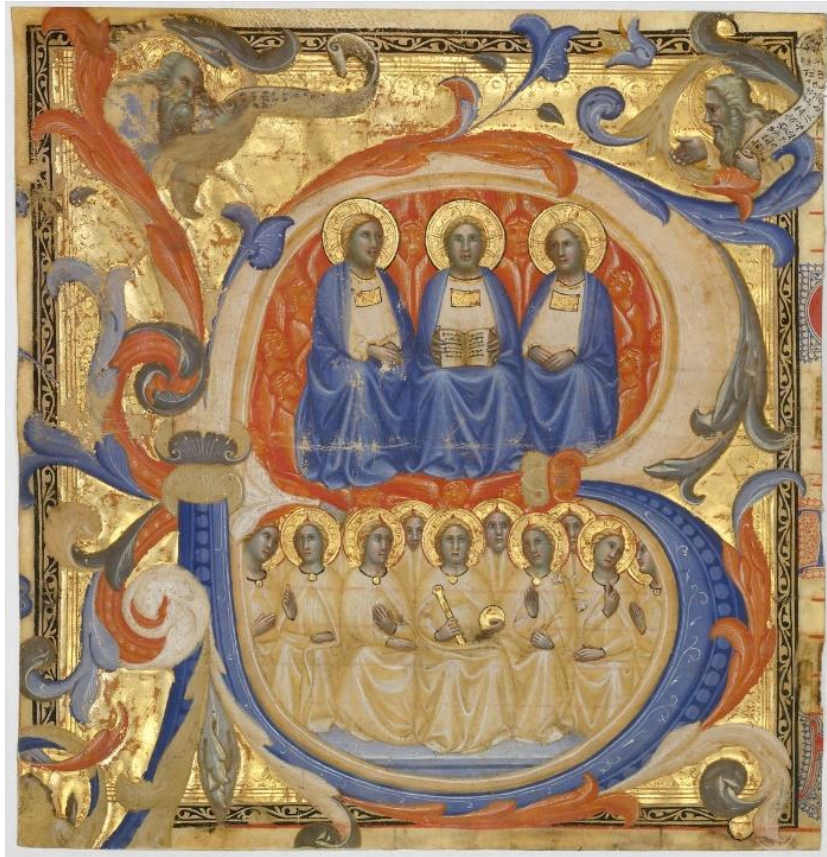
Trinity in the letter B, Master of the Codex Rossiano, c. 1387 The Met Museum, New York City