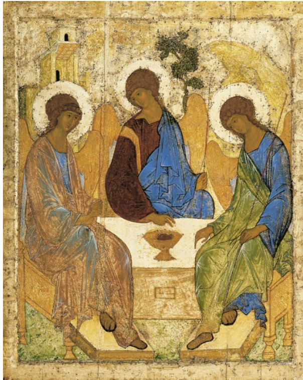
The Trinity also called The Hospitality of Abraham (Gen 18:1-8) by Andrei Rublev, 15th c. Tretyakov Gallery, Moscow.

In the Presence of a Greater Prelate Together with the Induction of the VIII Rector as Incumbent of this Parish Church at 3:00 pm