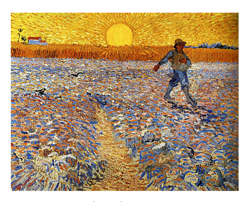
Sower with setting sun. Vincent Van Gogh, 1888, Kroller-Muller Museum, Otterlole