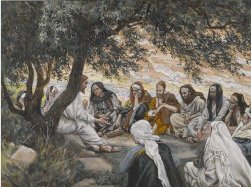
The Exhortation to the Apostles, James Tissot, c. 1890 Brooklyn Museum, New York City

Saint Thomas's Anglican Church 383 Huron Street, Toronto, Ontario M5S 2G5 416-979-2323 www.stthomas.on.ca office@stthomas.on.ca