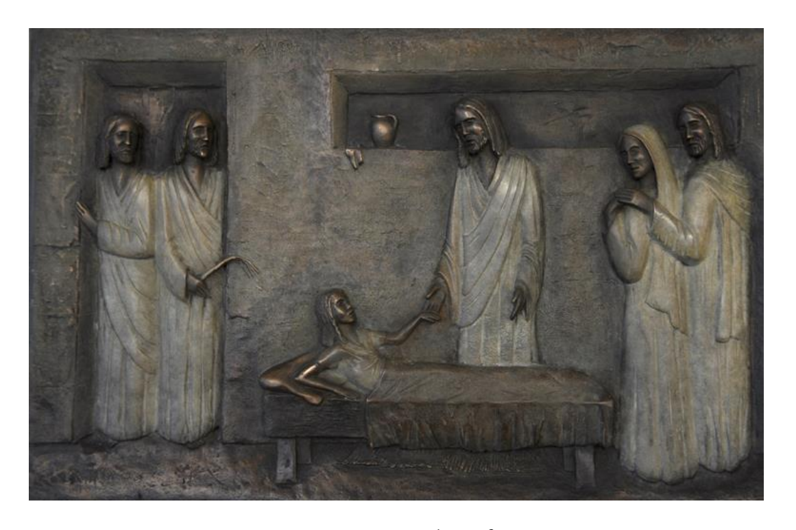
Jesus Raises Girl to Life Relief Sculpture National Children's Hospital, Tallaght