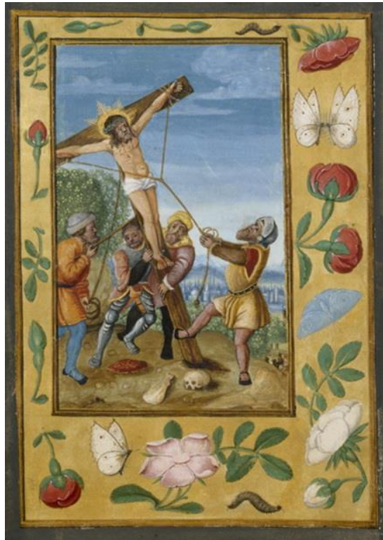
Leaf from a Book of Hours: The Raising of the Cross c. 1510-1520