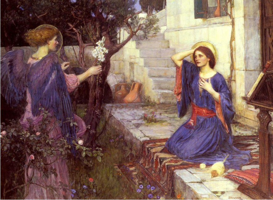
The Annunciation , John William Waterhouse, 1914 This painting is in a private collection.