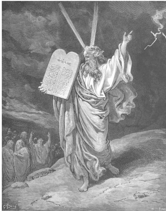
Moses showing the Ten Commandments, Gustave Doré, 1865 Bible illustration.