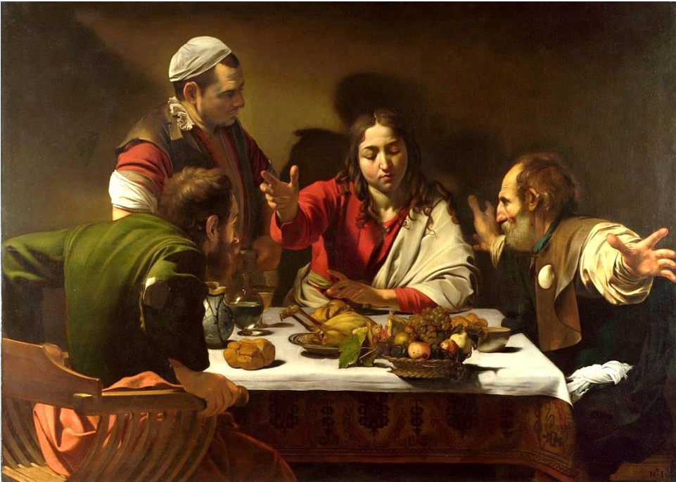
The supper at Emmaus, Caravaggio, 1601 The National Gallery, London

Evensong, Te Deum, & Benediction at 5:00 pm