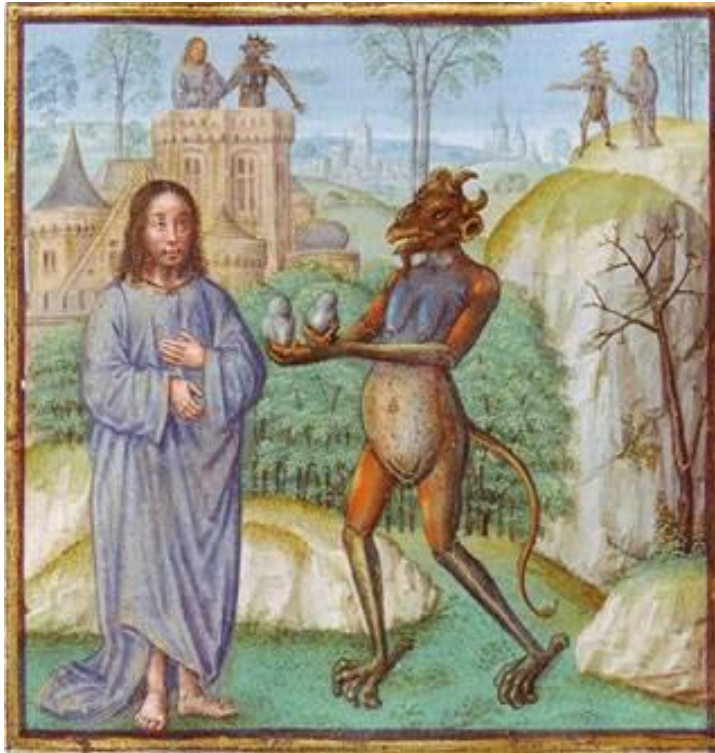
The Temptations of Christ from a 15 th century French illuminated manuscript

Saint Thomas's Anglican Church 383 Huron Street, Toronto, Ontario M5S 2G5 416-979-2323 www.stthomas.on.ca office@stthomas.on.ca