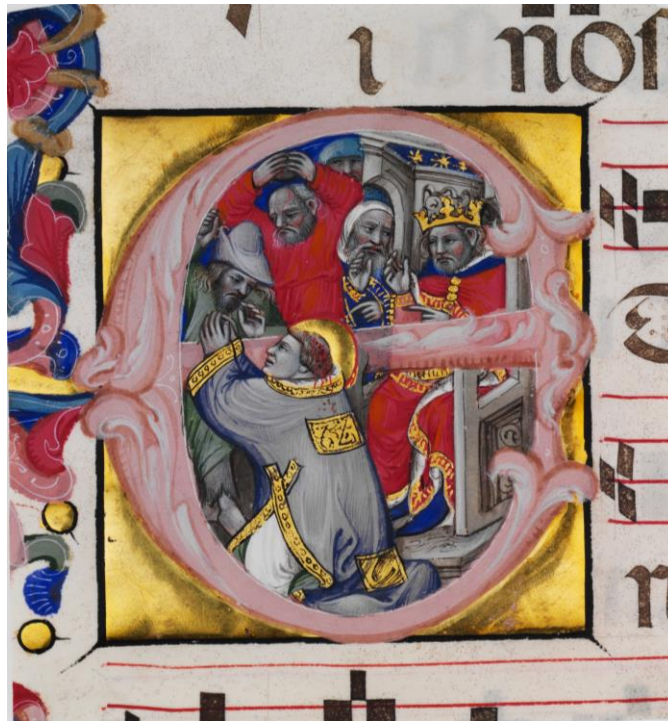
Manuscript Illumination with the Martyrdom of Saint Stephen in an Initial E, from a Gradualca . 1394–1402, Niccolò di Giacomo da Bologna