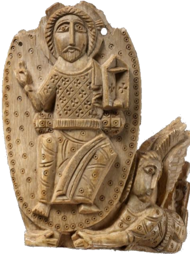
Tusk fragment with Christ Enthroned, c. 810-101 The Met Fifth Avenue, New York City

Saint Thomas's Anglican Church 383 Huron Street, Toronto, Ontario M5S 2G5 416-979-2323 www.stthomas.on.ca office@stthomas.on.ca