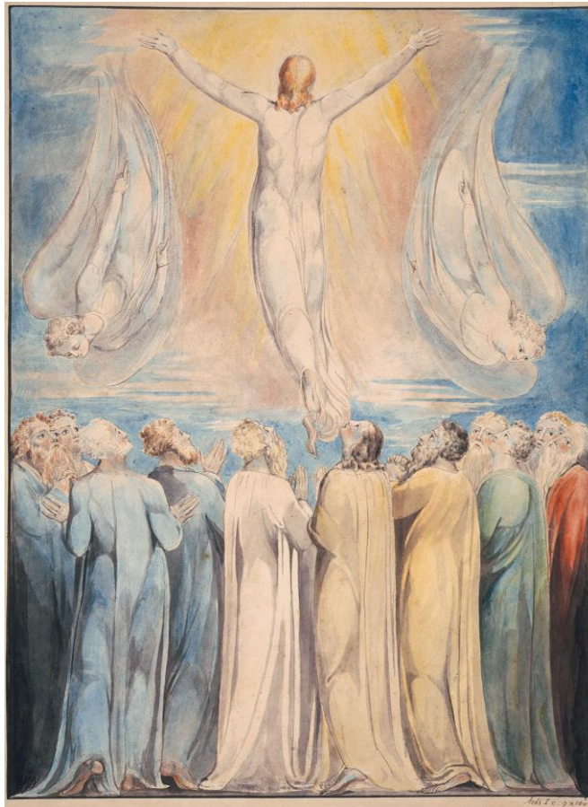
William Blake, The Ascension , c. 1805-6