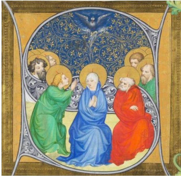
The Pentecost , from a Czech illuminated manuscript, c. 1400 The Museum of Fine Arts, Budapest