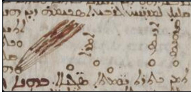
Codex Zuqninensis, Vat. Syr. 162, 136v from the Vatican Archives.

After the Sermon, please remain seated for a period of silent reflection. Please stand when the Celebrant stands.