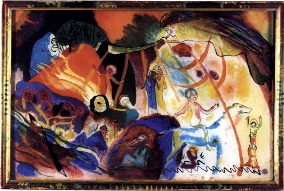
All Saints Day 2, Wassily Kandinsky, 1911 Lenbachhaus, Munich

Sunday, November 5, 2023 Sung Mass at 9:30 am