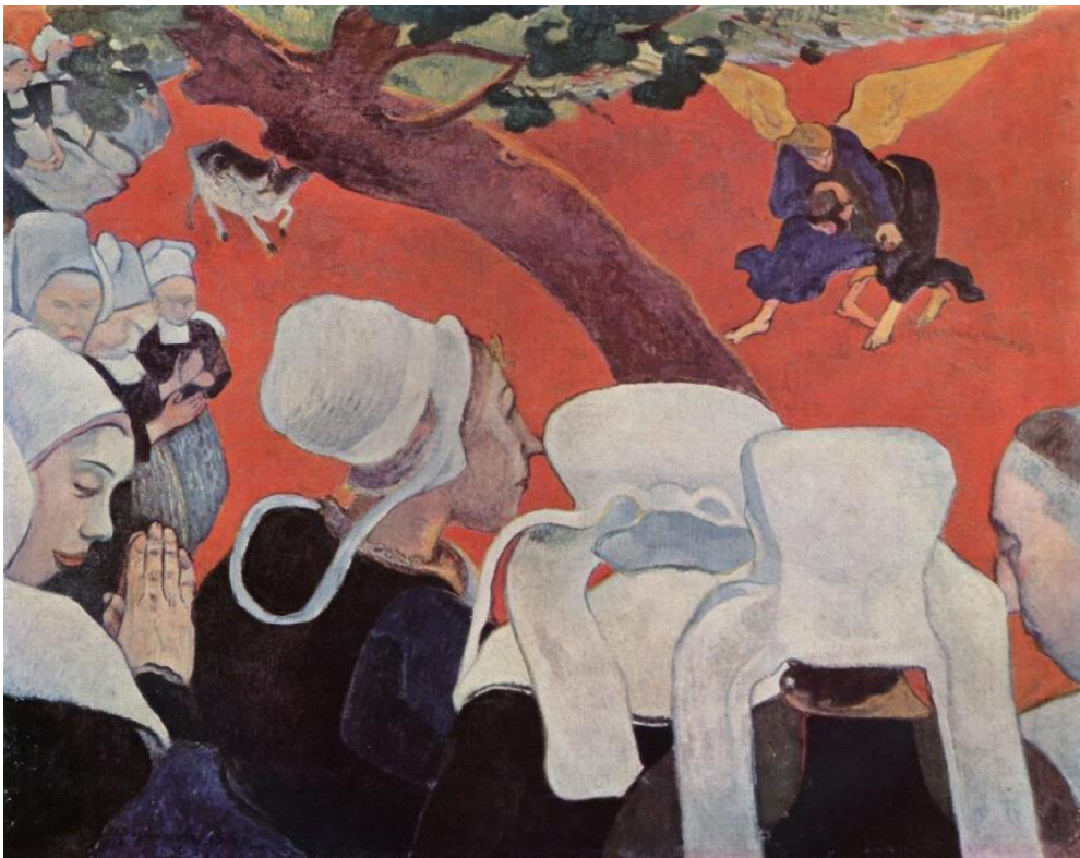
Vision after the Sermon (Jacob Wrestling with the Angel) , Paul Gauguin, 1888 National Gallery of Scotland, Edinburgh

Trinity XVIII Sunday, October 16, 2022 Sung Mass at 9:30 am