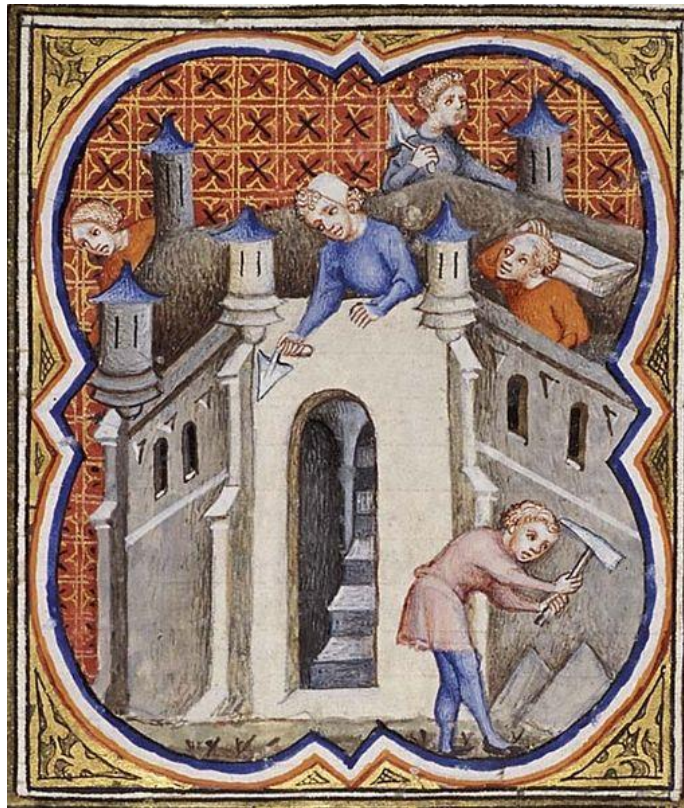
The Building of Solomon's Temple from the 'Speculum humanae salvationis,' c. 1450