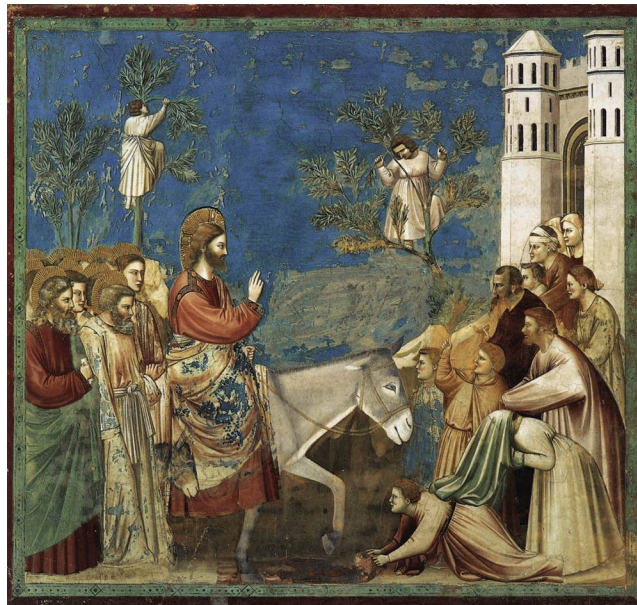
Entrance into Jerusalem Giotto di Bondone, 1305