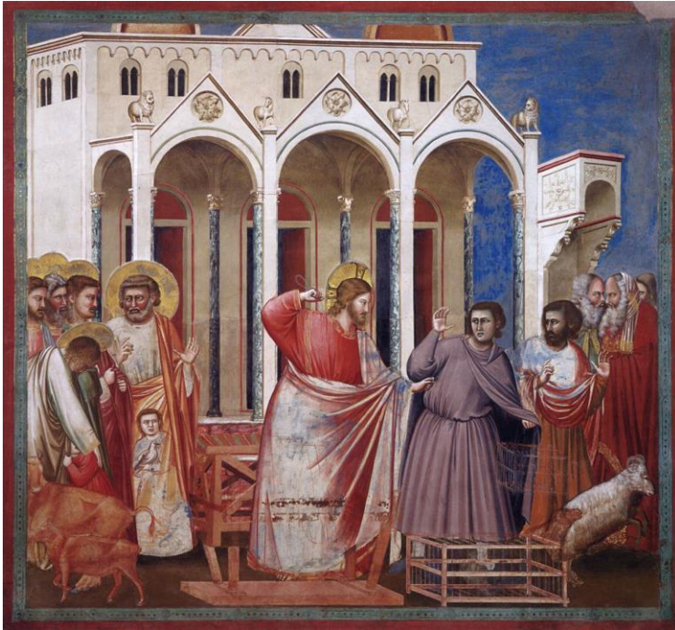
The Expulsion of the Money Changers, Giotto di Bondone, 1305 Cappella degli Scrovegni, Padua