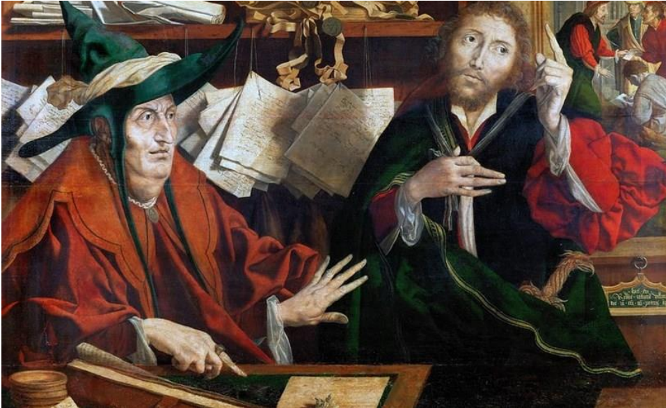
The Parable of the Unjust Steward , Marinus van Reymerswaele, c. 1540 Kunsthistorisches Museum, Vienna

Trinity XIV Sunday, September 18, 2022 Sung Mass at 9:30 am