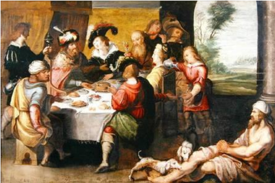
The Rich Man and Lazarus , Hans Francken, c. 1630 Cambrai Municipal Museum