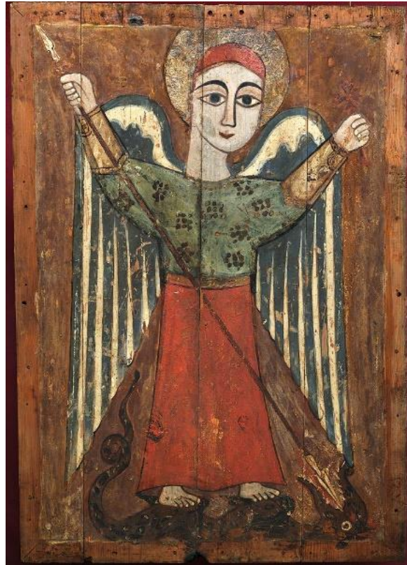
Archangel Michael, 17 th century Byzantine and Christian Museum, Athens

Saint Thomas's Anglican Church 383 Huron Street, Toronto, Ontario M5S 2G5 416-979-2323 www.stthomas.on.ca office@stthomas.on.ca