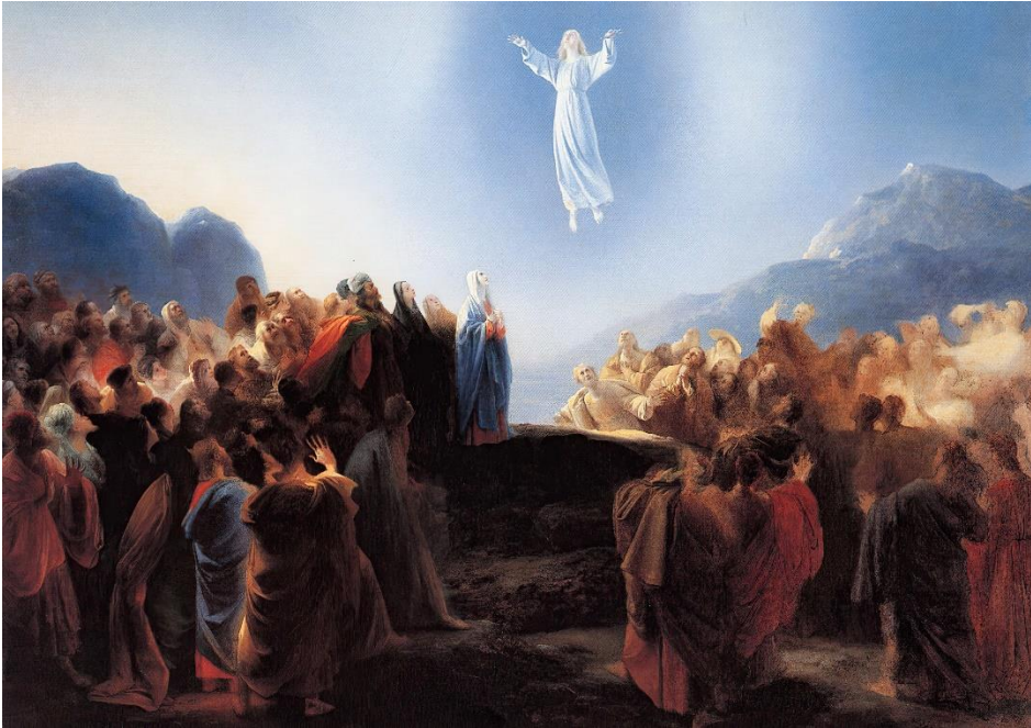
The Ascension, Domingos Sequeira, 1830 This painting is in a private collection.

Saint Thomas's Anglican Church 383 Huron Street, Toronto, Ontario M5S 2G5 416-979-2323 www.stthomas.on.ca office@stthomas.on.ca